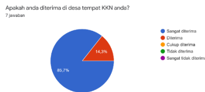
Table 4 The level of community acceptance in the KKNT

No wonder the students who took part in this activity really enjoyed their situation with the people they had just met. The majority of KKN participants answered that they really liked activities that they thought were new. In fact, for the surrounding community, the activities carried out by the KKNT participants were ordinary activities that they carried out every day.